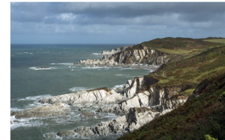
Rockham Bay and Bull Point