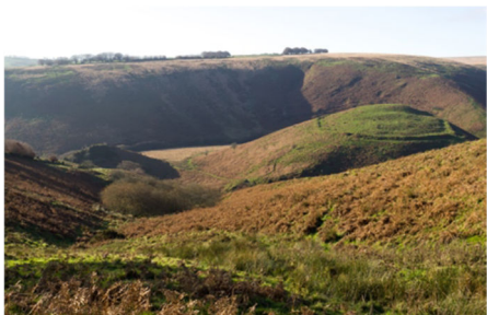
Cow and Calf

Walk 42 continues past Cow Castle on a one-way route to Exford, while walk 46 links Cow Castle with Landacre Bridge and Sherdon.