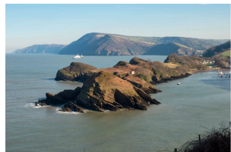
Watermouth from Widmouth Head