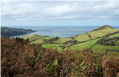
Little Hangman and Combe Martin Bay

Turn right just before the gate and descend steeply. Go down some steps to join a lane, turn right and cross a small bridge. Keep straight ahead where a track on the left heads back towards Great Hangman. The road bends to the left; ignore the footpaths, but turn right on a minor road with houses on the right. This descends, via some steps at the end, back to the main street in Combe Martin. Turn right then immediately left into a residents' road (Barton Gate Lane) with a signed public footpath. The road bends around to the right and becomes a track; shortly afterwards take a footpath forking to the left, heading upwards into the woods. Follow the zigzag path, keeping always left and upwards; after a long straight section bear right to walk beside a static caravan park (the main walk joins from the left). Join a driveway; turn right then left between the houses and stroll down to the main road. Turn right here to arrive back in 'seaside' Combe Martin, walking around the beach to the main car park.