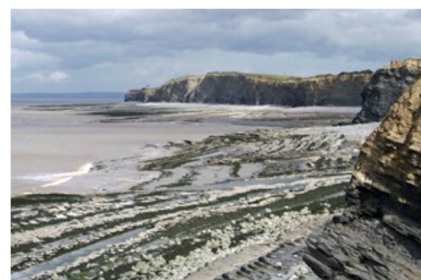
East from Kilve beach

Turn right on the road, then at a speed bump turn right on a footpath into a small wood. Fork right at the post, then enter a field. In five minutes or a little over the path turns inland to skirt around another holiday park. When you come to two gates, turn right as signposted on to a service road. Follow it around to the right, cross another road, then turn left out of the gate. In little more than a minute turn right on a footpath. Cross the stream then turn left on a service road and right on the main road. You can follow this into Watchet (take care as it is busy and lacks a pavement or verge), but if you have time before the tide turns, before the road bends at a bridge turn right into a closed-off parking area where there is a large lime kiln (2hr10mins, [5]). Descend to the beach and turn left to walk towards a low headland. Just as you reach it head upwards on steps: there are over 70. Keep to the clifftop, then go through a gate and continue towards the signalling house (with prominent flagpole). This is Splash Point, a former Victorian pleasure ground with views over the harbour. The path to the left takes you alongside the railway to arrive back at the car park, bus stop and station.