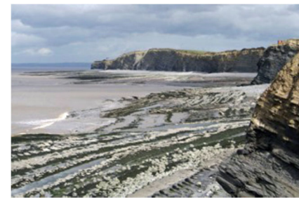
East from Kilve beach

Turn right on the road, then at a speed bump turn right on a footpath into a small wood. Fork right at the post, then enter a field. In five minutes or a little over the path turns inland to skirt around another holiday park. When you come to two gates, turn right as signposted on to a service road. Follow it around to the right, cross another road, then turn left out of the gate. In little more than a minute turn right on a footpath. Cross the stream then turn left on a service road and right on the main road. You can follow this into Watchet (take care as it is busy and lacks a pavement or verge), but if you have time before the tide turns, before the road bends at a bridge turn right into a closed-off parking area where there is a large lime kiln (2hr10mins, [5]). Descend to the beach and turn left to walk towards a low headland. Just as you reach it head upwards on steps: there are over 70. Keep to the clifftop, then go through a gate and continue towards the signalling house (with prominent flagpole). This is Splash Point, a former Victorian pleasure ground with views over the harbour. The path to the left takes you alongside the railway to arrive back at the car park, bus stop and station.