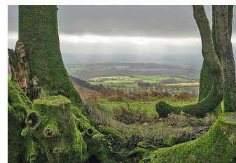
From Triscombe Stone

The second half of the walk is more typical Quantocks fare, and it starts with a steep (and potentially muddy) climb: take the stony path at the side of the former inn, following it through a gate and upwards until it emerges into the open at the top of the hill (1hr35mins, [4]). Turn left, with the beech trees on your left. There is a fair chance of seeing deer or ponies here. At a yellow-marked post take the left-hand, upwards fork on to open moorland. Head upwards until you reach a trig point: this is Will's Neck, at 384m the highest point on the Quantocks (1hr50mins). Take the right-hand fork to descend. There are views to the coast on either side: to Minehead on the left and Bridgwater Bay to the right. Drop down into light woodland and go through a gate to return to the Triscombe Stone car park.