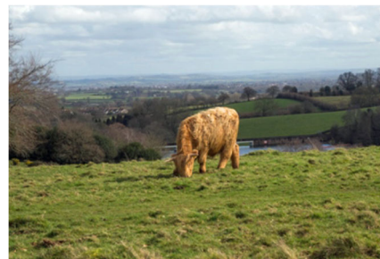
Above Hawkridge reservoir

Linked walk: Hawkridge, Aisholt and Triscombe (● 11.2 miles, ascents and descents of 655 metres). This even more varied and scenic walk combines walks 95 and 96 , crossing the Quantocks and taking in Will's Neck as well as the villages of Triscombe and West Bagborough, where there are pubs. Follow the main walk to Lydeard Hill but instead of going through the gate turn right on a track with a row of beech trees on the left. Now follow walk 95 from its 1hr20min point ([4]), to take in Will's Neck, Triscombe and West Bagborough. Arriving back at Lydeard Hill, turn right through the gate and take the leftmost path, rejoining the main walk.