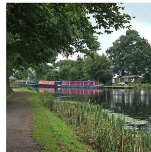
Moorings on the Grand Western

Go over the aqueduct and under East Manley Bridge. Just before the next bridge (Manley Bridge) turn right into a parking area, then right on to the road. In two or three minutes turn left on to a signposted, but almost hidden, cycle path (2hrs25mins, [5]). This is part of the old branch line to Tiverton town station, closed in 1967. The first part is narrow but the path soon opens out to become a wide track beneath trees, with ample room for walkers and cyclists. After 25-30 minutes of walking you will come to a gate with a National Cycle Network