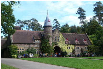
The stables at Knightshayes

Shorter version (● 3.4 miles, ascents and descents of 165m). At the T-junction after passing the walled garden turn right on to the main vehicle drive. Follow it past the house, continuing to the second gate on the right. This is the 1hr30min-point ([5]) of the main walk: turn right through it and follow the main walk instructions back to Bolham (or continue ahead for the parkland car park).